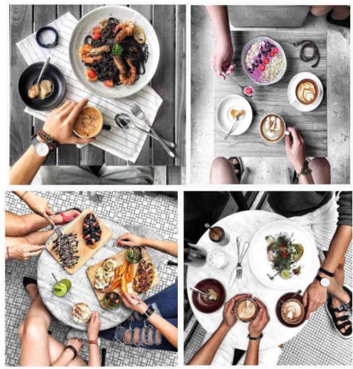
Fig. 3: Selected posts of leochan_kh that included #cafehopkl

One of the main criteria that was noticeable in leochan_kh 's Instagram posts is his consistent curation that has kept his posts standardized with similar styles of photography. Figure 3 shows some examples of his Instagram postings that features the hashtag #cafehopkl apart from other hashtags that were used. leochan_kh often use flat-lays for layout arrangements, which are shots from top view similar to the 'bird's eye view' that displays the overall table settings. The concept of flat-lay in photography was first known as 'knolling', a term coined in 1987 by Andrew Kormelow, a janitor at Frank Gehry's furniture shop (Fitzpatrick, 2016). It started off as arrangements of his displayed tools at the right angles on all surfaces. The idea of flat-lays is to declutter the Instagram feed, which viewers often pay attention on objects neatly laid out against neutral background.