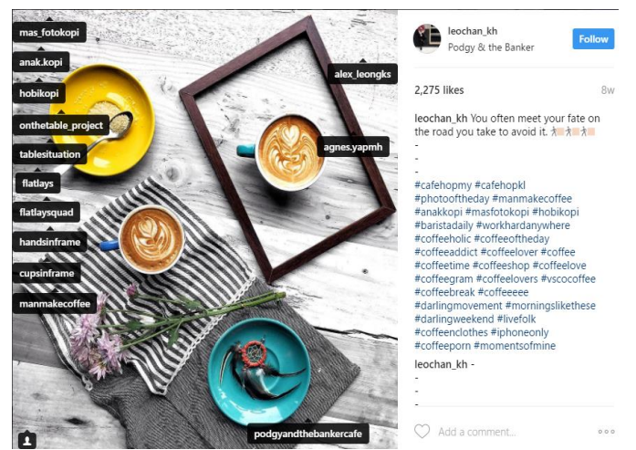
Fig. 4. Example of tags and hashtags used by leochan_kh

Upon further analysis of his Instagram posts, leochan_kh often used many types of hashtags. #cafehopkl is one of the hashtags that he often uses for Instagram users to discover his account. This works as one of the marketing strategy to lead Instagram users of certain interest to find out if others have posted using the same hashtags. The more users use the same hashtags, the source will be regarded more trustworthy. According to Eventys Partners (2015), brands want their fans to share their personal thoughts, comments and pictures on social networking sites (SNS), it shows that consumers care about the brand and feel which has successfully build solid relationships between the consumers and the brand. Not only limited to hashtags, leochan_kh also use tagging of other Instagram users and pages on his posts as seen on Figure 4 above. He maximizes his exposure and make it noticeable. Most of the tags that he use is related to coffee enthusiasts which he would like to be linked to the curation of his posts.