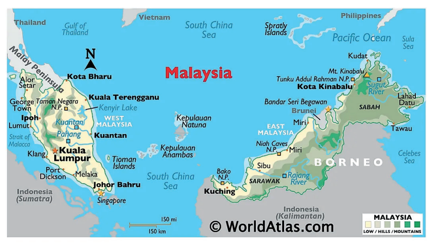
Figure 1 - Location of Kelabit Highlands (Borneo, Sarawak, Malaysia)

(Indonesia). Nowadays, the area can be reached by two main modes of transportation: a 12-hour journey from Miri on logging roads built in the late 1990s and early 2000s; and a rural area air service, first introduced in 1962, which is the fastest option. Eighteen seated Twin-Otter aircrafts now fly to the area three times a day.